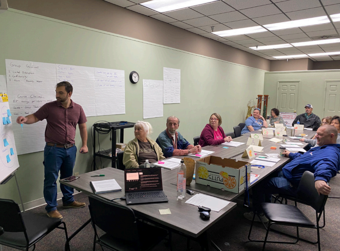
Salt & Light course facilitated by an Anabaptist church.